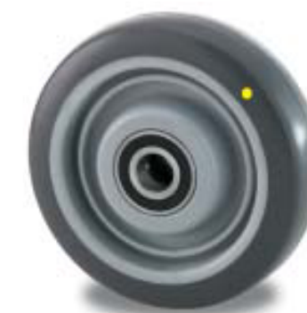
RUOTA SU CUSCINETTI WHEEL ON ORIGINAL BALL BEARINGS

ELECTRIC CONDUCTIVE GREY NON-MARKING thermoplastic polyurethane tyre wheel. The tread tyre is injected on the centre core by double mechanic anchoring. Central polyamide core on original ball bearings DIN 625. The original ball bearings on the wheel are supplied with 2RS water proof protection as standard.