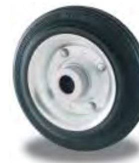
RUOTA SU RULLI WHEEL ON ROLLER BEARING

Black rubber tyre 85 Sh/A wheel. Zinc plated steel rims on roller bearing or on original ball bearings DIN 625.