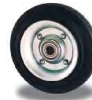
RUOTA SU CUSCINETTI WHEEL ON ORIGINAL BALL BEARINGS