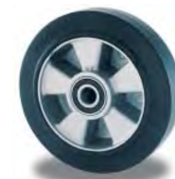
RUOTA SU CUSCINETTI WHEEL ON ORIGINAL BALL BEARINGS

Wheel centre made of aluminium with black elastik rubber 70 Sh/A hub on water proof original balls bearings DIN 625.